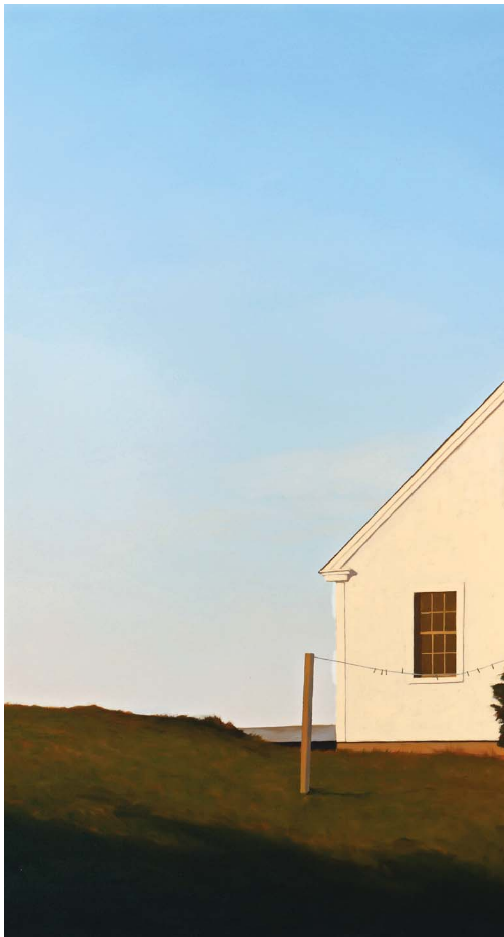
HOPPER'S HOUSE #2, OIL ON CANVAS, 30 X 40"

The artist painted Hopper's House #2 in a manner that balances moody tonalism with still having that fresh light of the coastal area. Holland enjoys the effective contrast of light against dark and, like Hopper, his realistic