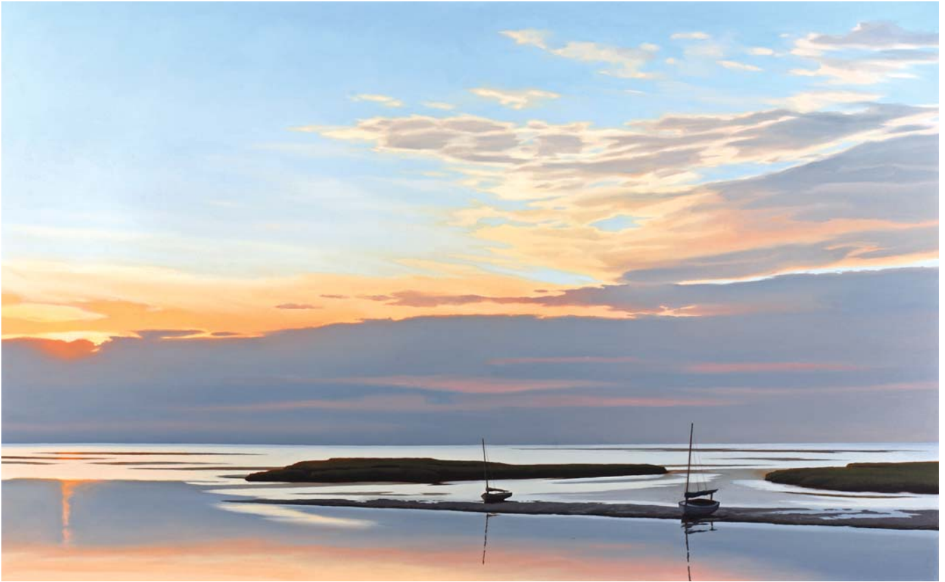
SAILBOATS AND SANDBARS, OIL ON CANVAS, 30 X 48"