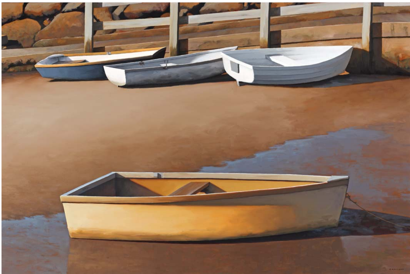
DRY DINGHIES, OIL ON CANVAS, 24 X 36"

compositions embody the iconic nature of the piece and are simplified with the clutter and unnecessary background eliminated.